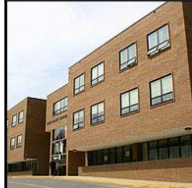
Pictured from top to bottom: Sligo Creek Elem. School; East Silver Spring Elementary School; Portable passageway at Takoma Park Elementary School; Piney Branch Elementary School.